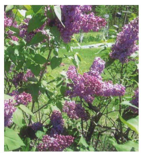
"When Lilacs last in the Dooryard Bloomed" – Whitman