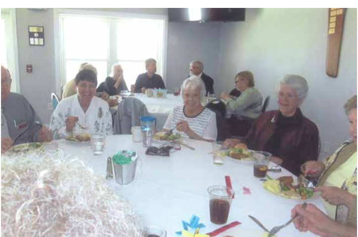
Members enjoying the buffet