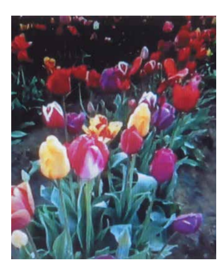
"Tulips brighten the spring. They cheer up our lives with the colours they bring." — Mand